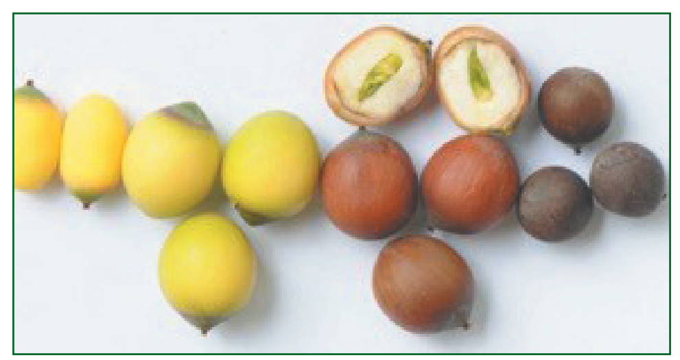
Figure 4. American lotus nuts in various stages of maturity. Those on the left (yellow in color) are slightly immature but edible; those with the chestnut brown fruit coats are ideal; those are the right have the texture of ball-bearings.