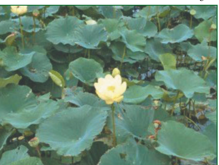
Figure 2. American lotus flower in Lotus Garden, Tabernacle Creek, Virginia Beach, Virginia.