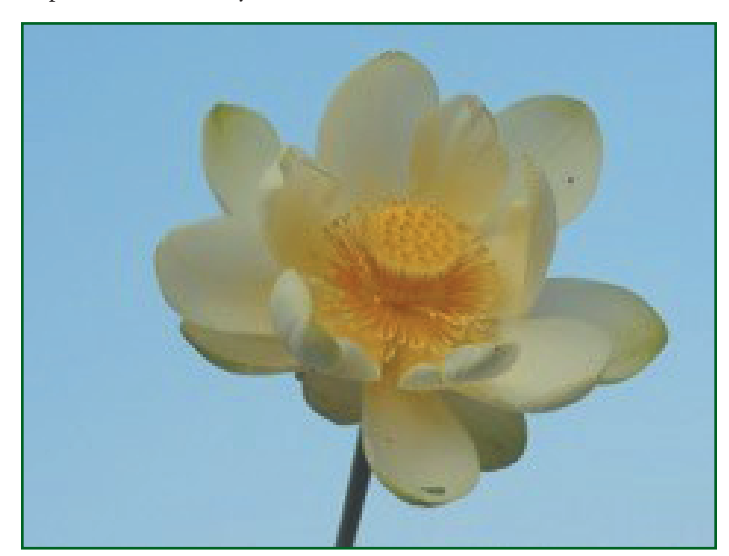
Figure 1. A large population of Nelumbo lutea in Lake Gaston, North Carolina.

Unlike so many wild plants, the nuts of American lotus are actually tasty. The taste reminds me of filberts ( Corylus maxima ) imported from Turkey or our native filberts ( C. cornuta, C. ameri-