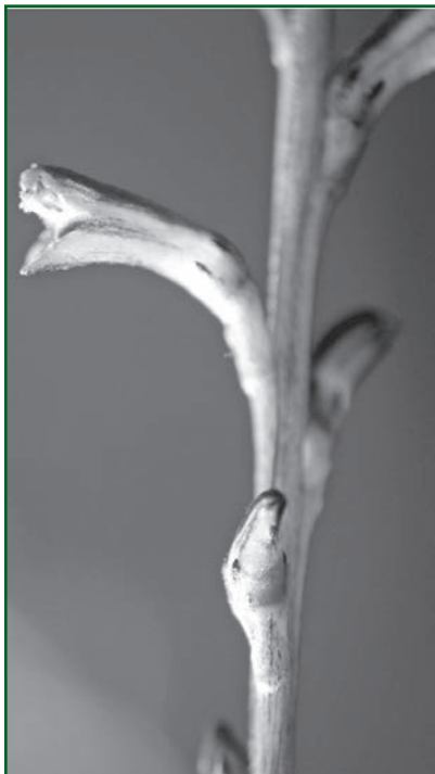
Chasmogamous flower, upper left; cleistogamous flowers below.

I find it amazing that so little is known about the most frequent parasitic angiosperm in North America (a close second would be bastard toadflax, Comandra umbellata of the Thesiaceae, formerly in the Santalaceae). Here close at hand throughout the Southern Appalachian region is a common plant with uncommon nutrition and floral biology inviting further research.